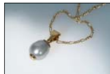
1st prize in the Raffle—A Pearl Necklace

It is hoped that enough funds will be raised to purchase and install a new commercial oven at the School's house in Burswood which will be welcomed with great joy from the Biscuit Baking Team. So if you haven't got a ticket be sure to purchase one on your first evening back at School. There are only a few books of unsold tickets remaining.