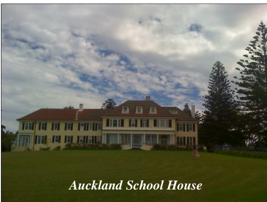
Auckland School House