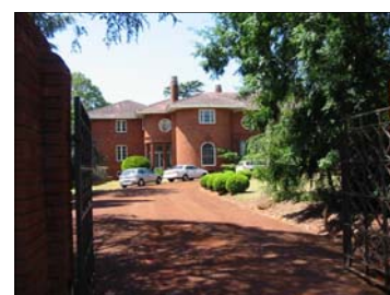
The Sydney School House - Mahratta

The next Sanskrit Weekend will be held on February 25 & 26, 2006.